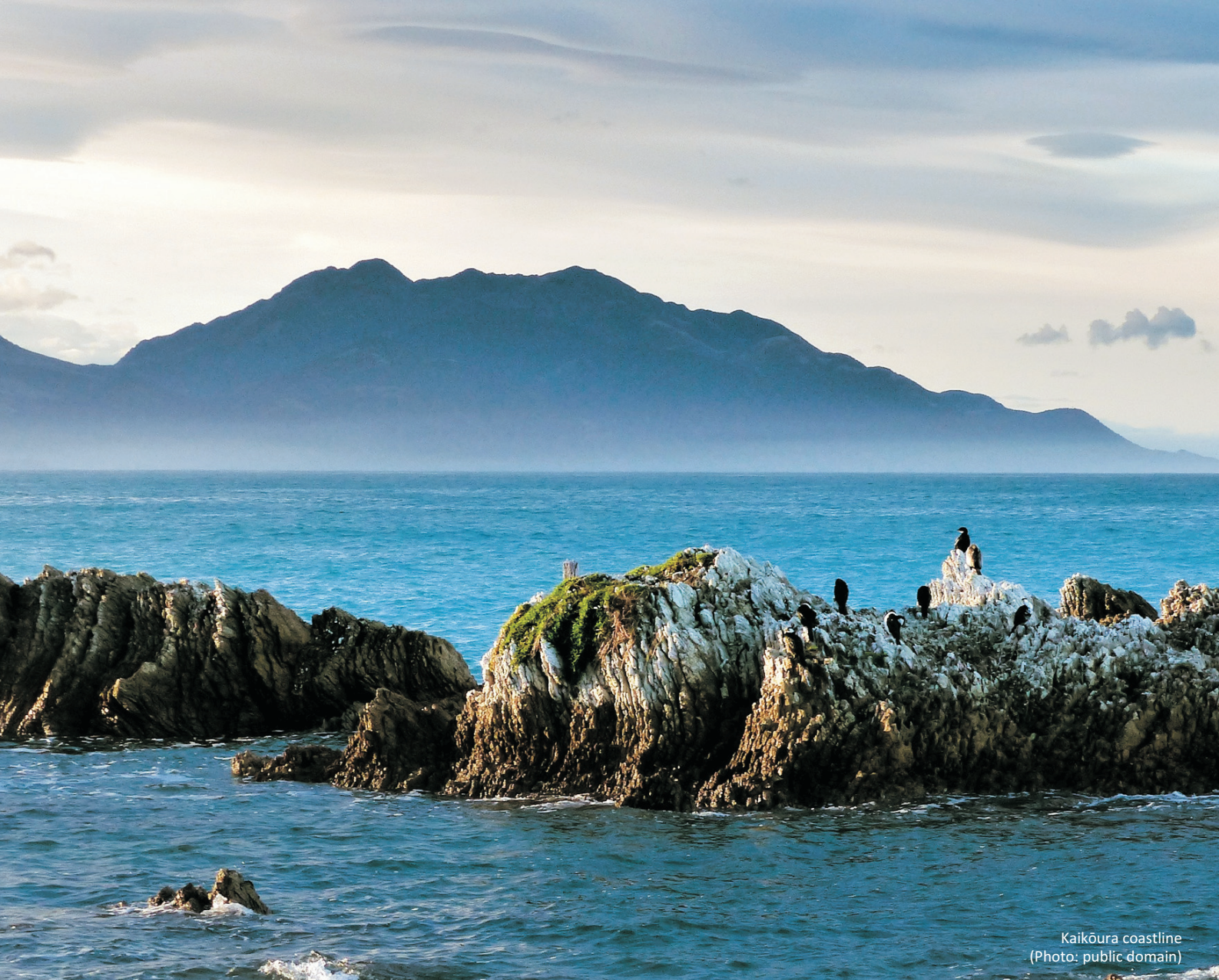
Kaikōura coastline