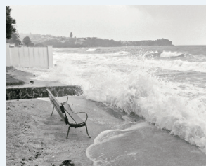
Adapting to the consequences of climate change Engaging with communities Special Publication 2016