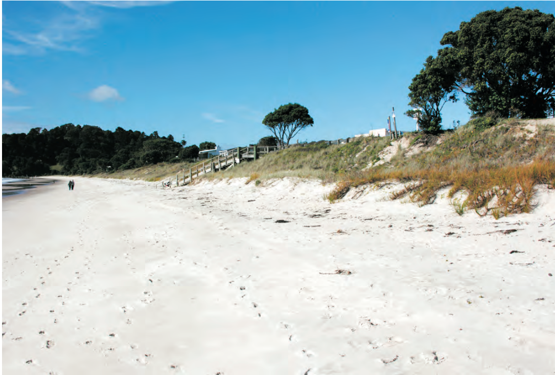
Figure 1: Whangapoua Beach, 19 April 2008 Note the healthy foredune and spinifex growing to the dune toe.

from the lower beach profile between mean sea level and the level of maximum wave run up. The sediment was then graded up the dune with a bulldozer. On completion of the works, a 3 to 5 m width of high tide beach was maintained and the following autumn the reshaped dunes were planted with native dune binding species, pingao and spinifex. The total cost to date has been about 3 to 4 per cent of that of a seawall.