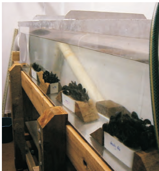
Mussels ( Mytilus galloprovincialis ) in a flume experiment at Portobello Marine Laboratory to test mussel clearance rates under different salinity and flow rate regimes. A series of experiments were used to ground-truth data collected in estuaries.