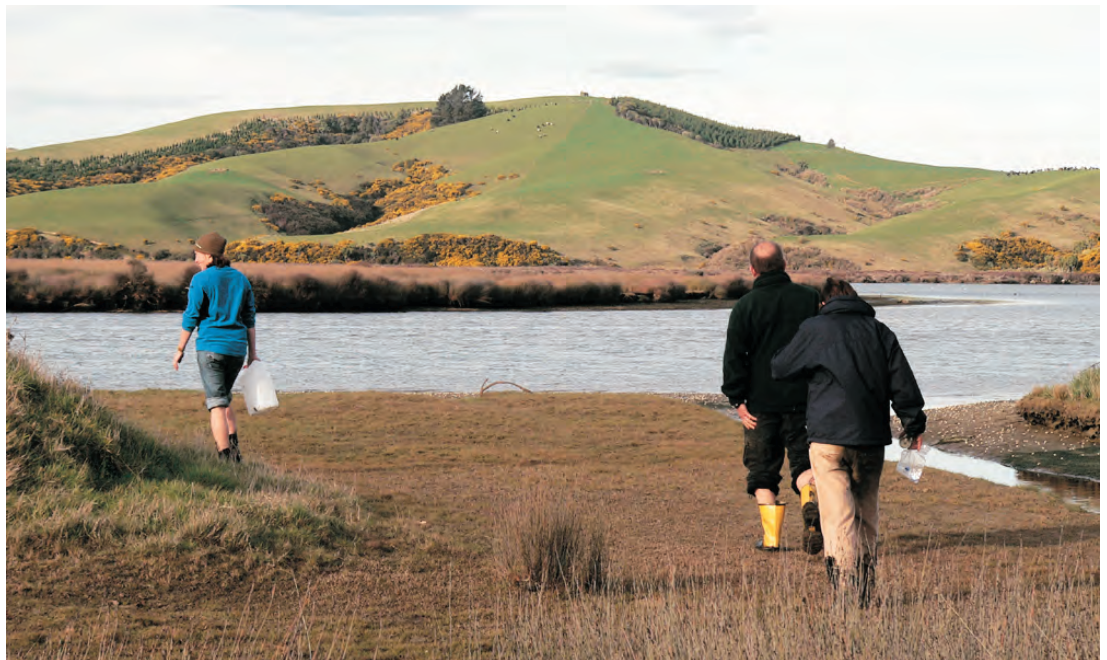
Marine science students from the University of Otago taking water column samples for nutrients in Tokomairiro Estuary, an ecosystem with an agricultural and forest-influenced catchment.