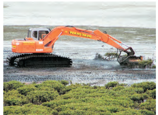
Omokoroa mangrove removal.

The estuary care groups, who have till now cleared the mangroves by hand, are over the moon at the progress and reckon it's "a year's work done in a day".