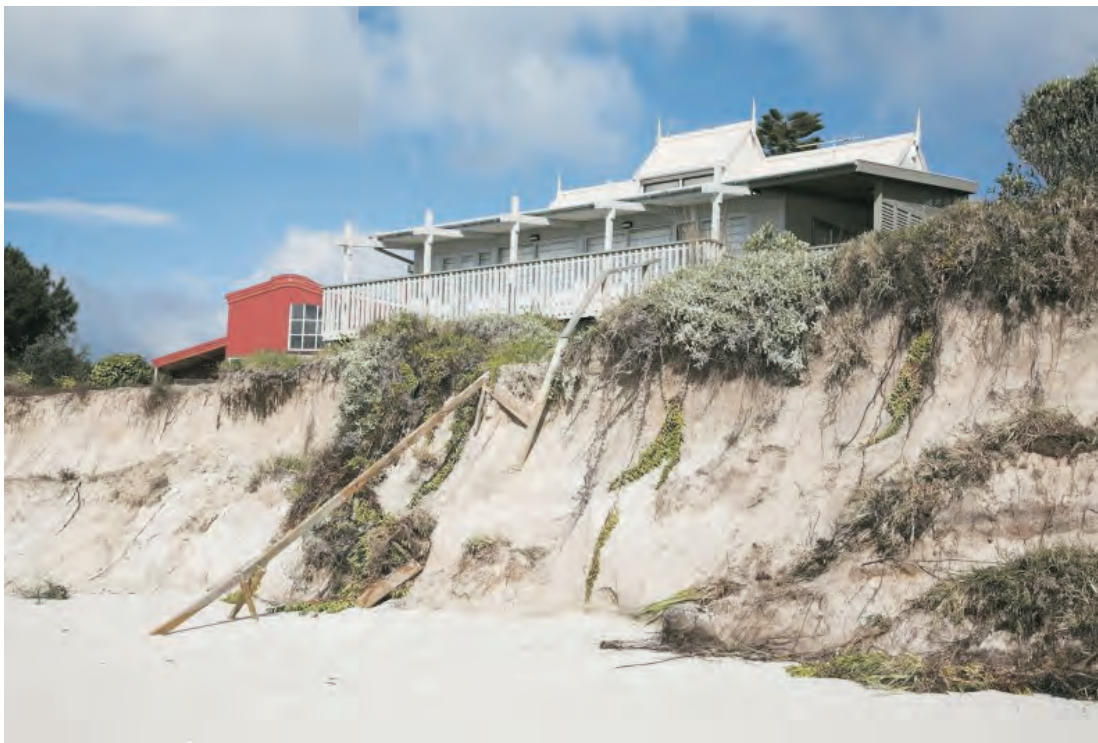
Figure 2: Dune erosion following the storms of winter 2008.