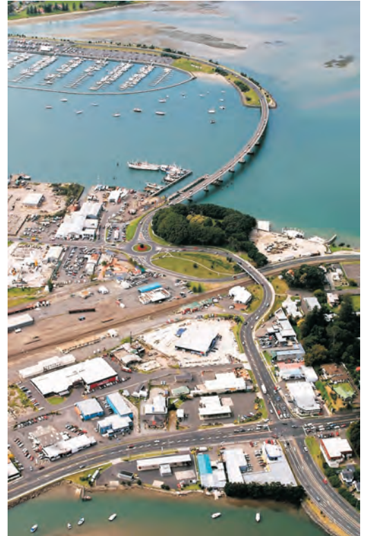
Tauranga Harbour Bridge – then...

Article prepared by Cushla Loomb, Beca Planning cushla.loomb@beca.com