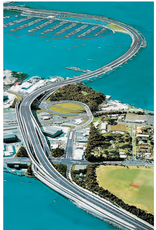
...and now (both photos courtesy Beca).