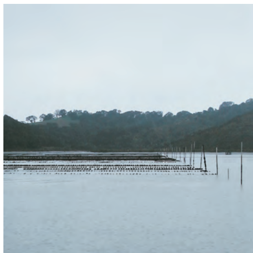
Submissions were recently received regarding the report Re-Starting Aquaculture .

The submissions are being considered as part of policy development. Cabinet approval of the proposed policy for aquaculture reform will be sought in March.