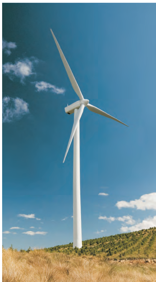
On 1 March 2010 the New Zealand Standard NZS 6808:2010 Wind Farm Noise was released. Meridian Energy's White Hill Wind Farm, Southland.