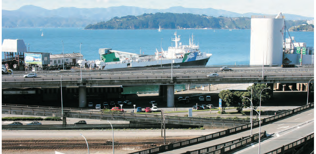
View of Wellington Harbour.

For more information visit www.gns.cri.nz/news/release/20100222.html .