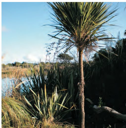
Since 2004 the Waikanae Estuary Care Group has planted over 25,000 native trees.

Visit www.gw.govt.nz/our-environmental-champions-200/ for more information about Greater Wellington's environmental awards.