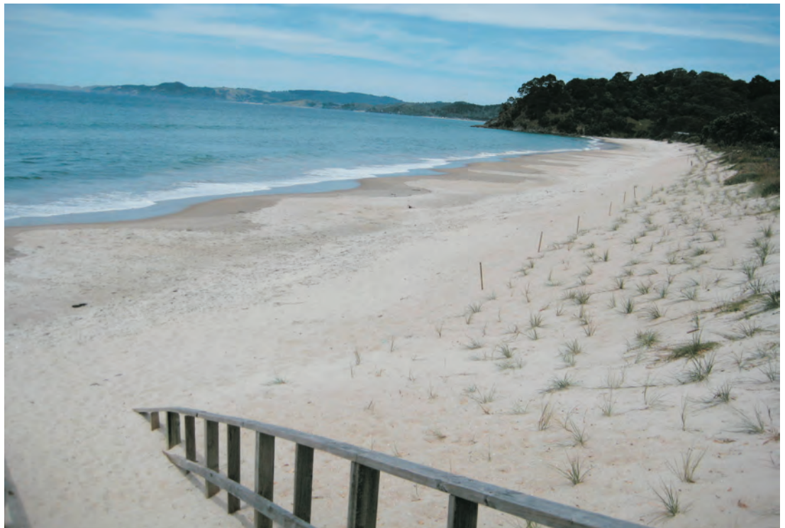
Figure 4: Recovery one year later on 11 December 2009; planted with native dune-binding vegetation.