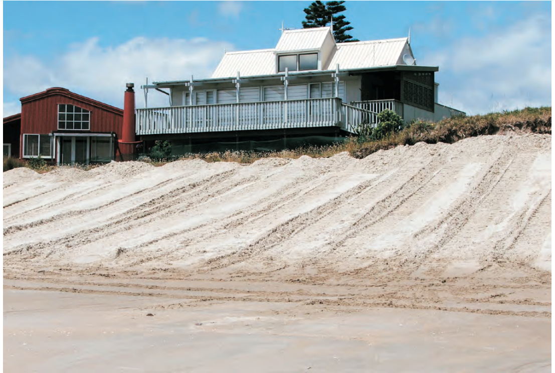
Figure 3: Following the beach scraping, 11 December 2008.

Contact Amy Robinson ( amy.robinson@ew.govt.nz ) and Jim Dahm ( jdahm@xtra.co.nz ) for more information.