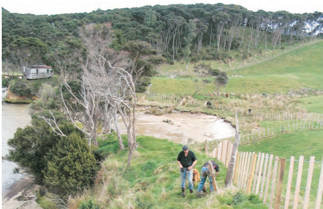
Les and Evelyn Shaw have fenced the harbour edge and other areas of their property and planted hundreds of pohutukawa.