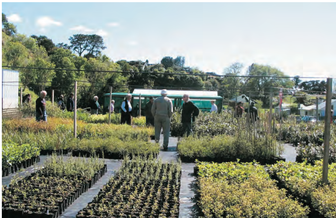
Pohutukawa seedlings at Te Hinengaro O Kawhia Trust Nursery.