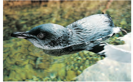
Northern little blue penguin swimming, Aorangi, Poor Knights Islands, March 1985.

During January, over 100 little blue penguins were found dead on beaches around Taranaki. There were various theories about why the deaths may have occurred, with the main two possibilities being a toxic algal bloom (red algal blooms had been noted around the coast at the same time) and starvation. DOC undertook water sampling to see if the algal blooms may have been the cause, while dead penguins were sent away for examination. Results so far suggest starvation was the likely cause.