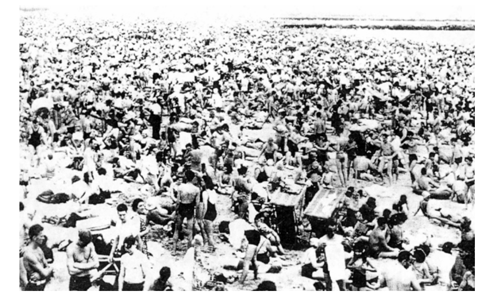
Coney Is beaches were crowded - even in 1941!

Estuaries get it from both sides – sediment is eroded from catchments and delivered to headwaters by streams and rivers, and waves and tides push marine sediments in through the mouth. What happens to the ecology when changes in landuse or other activities change the amount and type of sediment deposited in the receiving estuary? That question is being addressed in NIWA's research programme 'Effects of Sediments on Estuarine Ecosys-