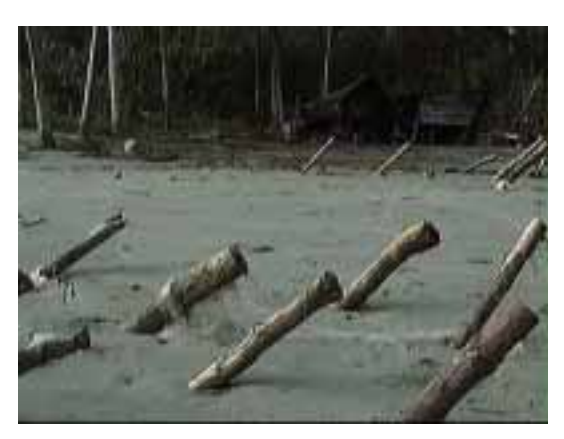
Remains of a house at Bliri River. Houses in the foreground were totally destroyed, while those in the background were badly damaged. Wave height varied from 3 m to 11 m over a distance of about 250 m

that a submarine sediment slump triggered by an earthquake is the likely cause of the Saundaun Tsunami. The main reasons for this are: