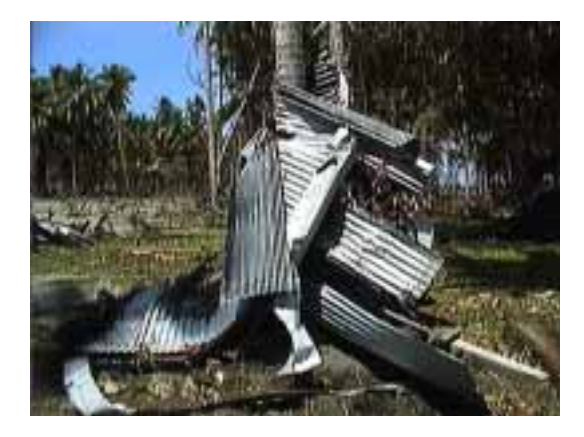
"Tintree" - roofing iron wrapped around a palm tree at Sissano Village

However, the numerical modelling assumed the same phase speed as seismic tsunami. The recent research into the Saundaun Tsunami indicates that the waves may travel up to 1500 km h<sup>-1</sup>. If the revised values were adopted, the source of the 1947 tsunami would be near the base of the continental slope. Recent surveys along the eastern margin of New Zealand indicate that there are many submarine slumps